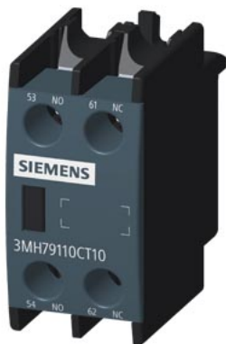
Auxiliary Switch Front 1 NO + 1 NC Current path for 3MT7 and 3MH7 Contactor Screw terminal