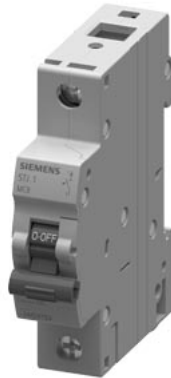
SINOVA, Miniature Circuit Breaker 240/415V 10kA, 1-pole C, 20 A