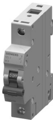
SINOVA, Miniature Circuit Breaker 240/415V 10kA, 1-pole C, 32 A