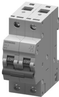
SINOVA, Miniature Circuit Breaker 415V 10kA, 2-pole C, 6 A