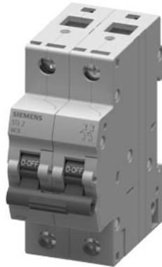
SINOVA, Miniature Circuit Breaker 415V 10kA, 2-pole C, 16 A