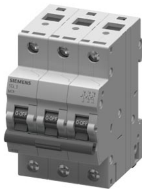
SINOVA, Miniature Circuit Breaker 415V 10kA, 3-pole C, 25 A