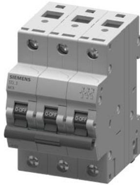
SINOVA, Miniature Circuit Breaker 415V 10kA, 3-pole C, 50 A