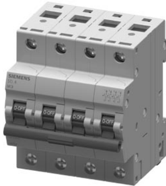
SINOVA, Miniature Circuit Breaker 415V 10kA, 4-pole C, 32 A