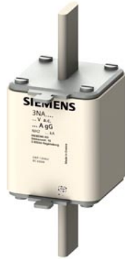
LV HRC fuse element, NH2, In: 400 A, gG, Un AC: 500 V, Un DC: 440 V, Front indicator, live grip lugs