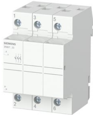
SENTRON, cylindrical fuse holder, 10x38 mm, 3-pole, In: 32 A, Un AC: 690 V