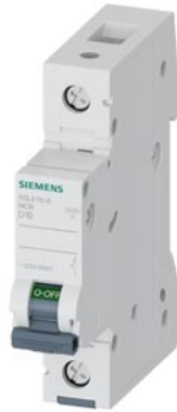
Miniature circuit breaker 230/400 V 10kA, 1-pole, D, 10 A