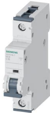
Miniature circuit breaker 230/400 V 6kA, 1-pole, C, 16A, D=70 mm