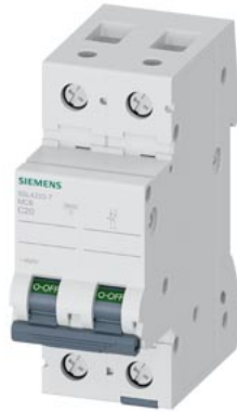
Miniature circuit breaker 400 V 10kA, 2-pole, C, 20 A