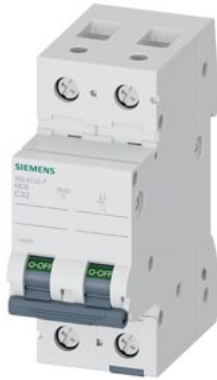
Miniature circuit breaker 400 V 10kA, 2-pole, C, 32 A