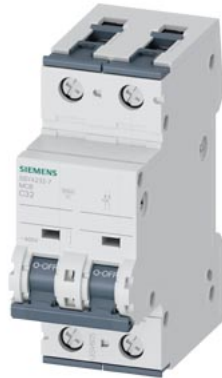
Miniature circuit breaker 400 V 10kA, 2-pole, C, 32 A, D=70 mm