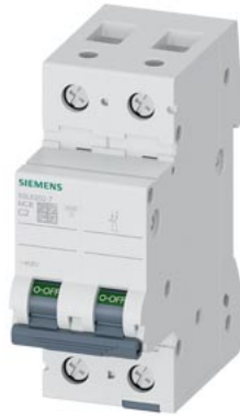
Miniature circuit breaker 400 V 6kA, 2-pole, C, 2A