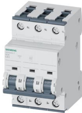
Miniature circuit breaker 400 V 6kA, 3-pole, C, 63 A, D=70 mm