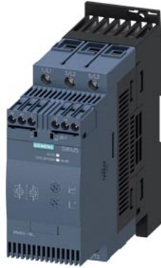
SIRIUS soft starter S2 63 A, 30 kW/400 V, 40 °C 200-480 V AC, 110-230 V AC/DC Screw terminals